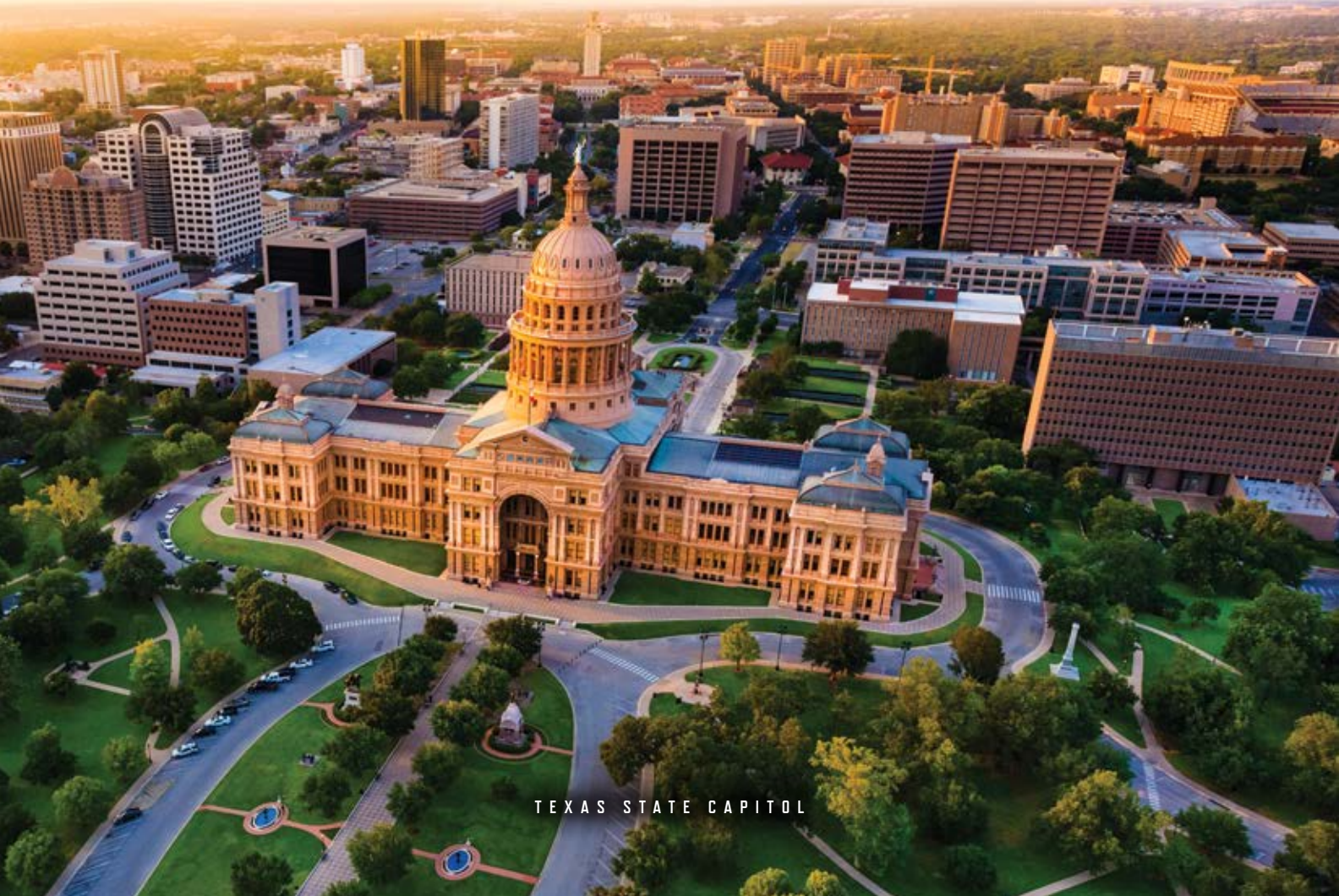
TEXAS STATE CAPITOL

The committee identified several critical needs: better mental health screening in jails, competency restoration and the pressures on Texas' obsolete state hospital system, and improved jail diversion. It also listed several issues for future study.